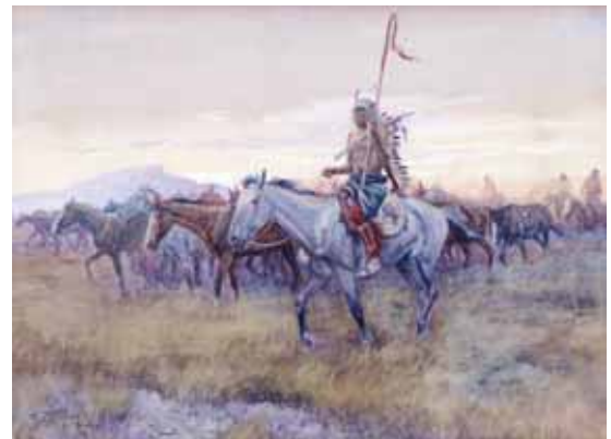
Charles Russell, Stolen Horses , 1911, Glenbow Museum