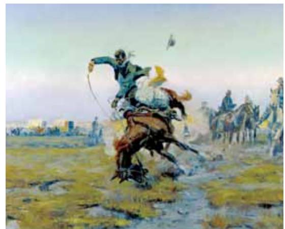
Charles M. Russell, One of the Rough String , 1913, Glenbow Museum, Calgary, Alberta