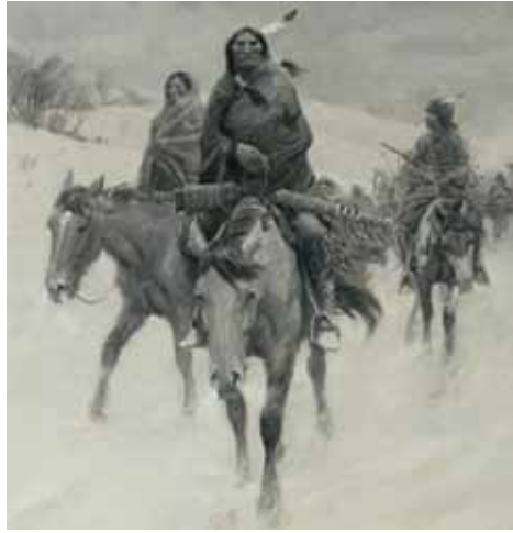
Warrior's Return , Glenbow Museum, Calgary, Alberta