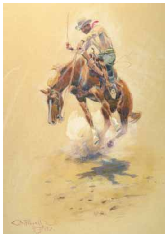
Charles M. Russell, Bucking Bronco , 1917, Glenbow Museum, Calgary, Alberta

Your annual membership renewal includes all of the benefits you value: complimentary regular admission, a discount on programming and in the museum store, complimentary subscriptions to PPHMNews and the Panhandle-Plains Historical Review , and invitations to all museum events, including those for members only. Upgraded membership levels include free admission for family members, guest passes, discounts on archive reproductions and museum space rental, and parking passes. Members of the top annual level, the Goodnight Circle, are recognized with a lapel pin and invitations to special Goodnight Circle events.