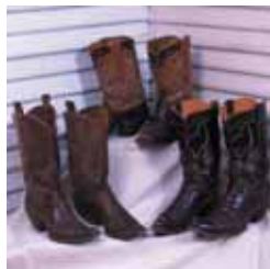
NECESSITY TO FASHION