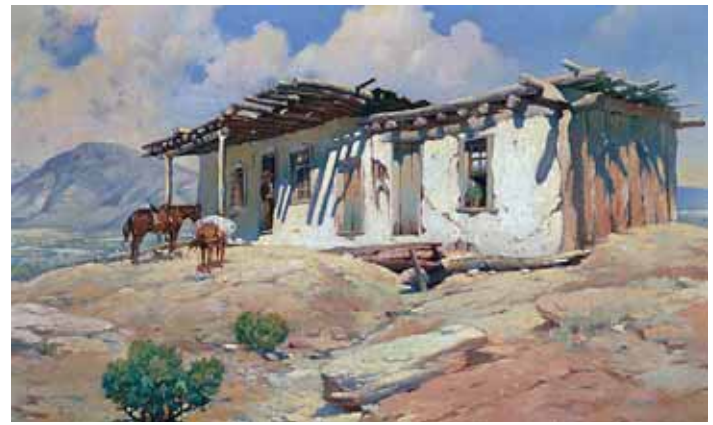
Granville Bruce, A Deserted Stagecoach Station in New Mexico

As a member of the museum, you are part of a group determined to tell the story of the region. In the great tradition of citizens rallying to support important efforts, you enable the Panhandle-Plains Historical Museum to preserve history, educate citizens, and open eyes to new perspectives. The museum's members have a noble role in our community and reflect the heroism that is needed today. As we move forward, realize how important your support is for the benefit of all.