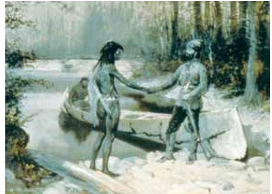
Frederic Remington, The Courier du Bois and the Savage , 1891, Sid Richardson Collection of Western Art