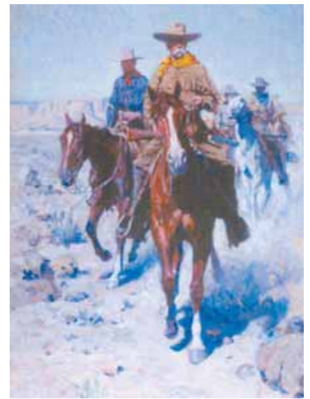
W. Herbert Dunton, The Return to the Reservation , 1910, Collection of Glenbow Museum

Included in the exhibition will be Dunton's The Reconnaissance , a reinterpretation of Remington's A Reconnaissance (1902) recently found in a Boston attic; Dunton's The Pursuers , found in a cabin in upstate New York, and The Return to the Reservation , purchased by the Glenbow Museum, as a Frederic Remington painting in 1965. The subject of Remington and Russell fakes will be covered in an ancillary exhibition. See related story "Was Glenbow Duped" in this issue.