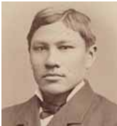
A KIOWA'S ODYSSEY