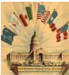
MAPS OF TEXAS