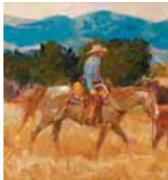
WESTERN ART SHOW AND SALE