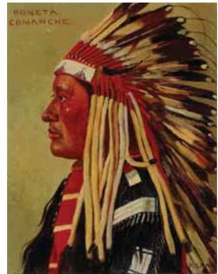
E.A. Burbank, 1897 Painting purchased with proceeds from 2006 Invitational

Proceeds from the Invitational are used to enhance PPHM's art collection and bring the finest in historic Southwestern art to the region.